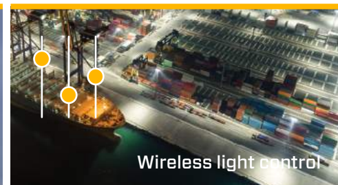
Wireless light control