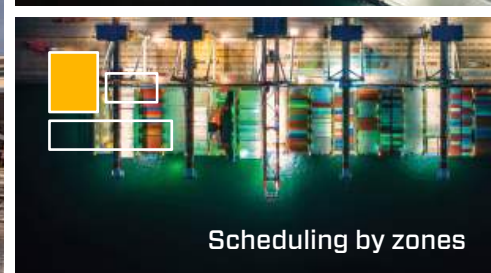
Scheduling by zones