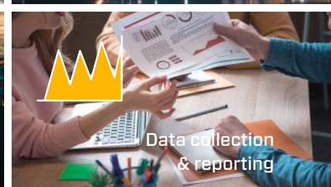
Data collection & reporting